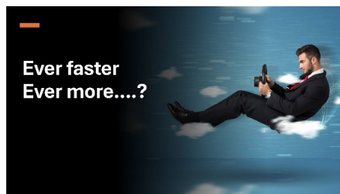
Wallpaper

Antonio Guterres. Secretary-General's remarks to launch the Special Edition of the Sustainable Development Progress Report. 25. April 2023